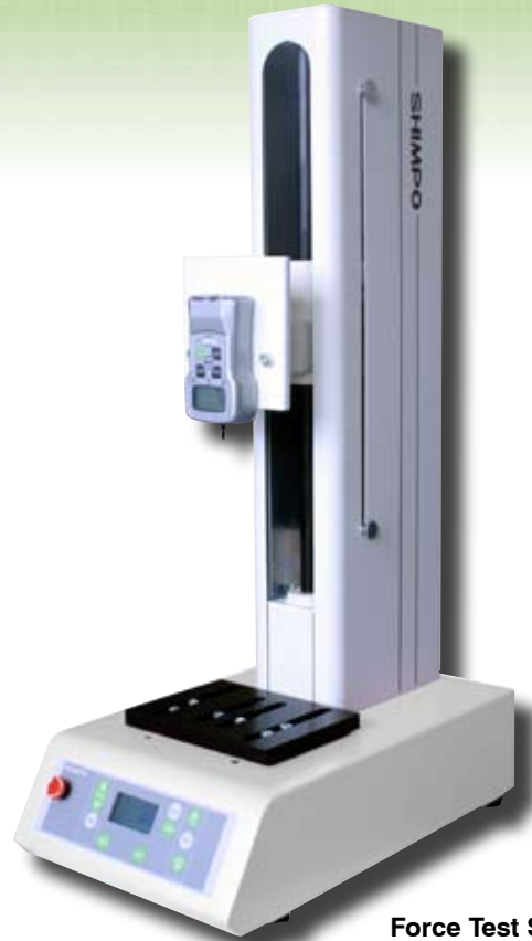
Force Test Stand shown with Force Gauge (Sold Separately)