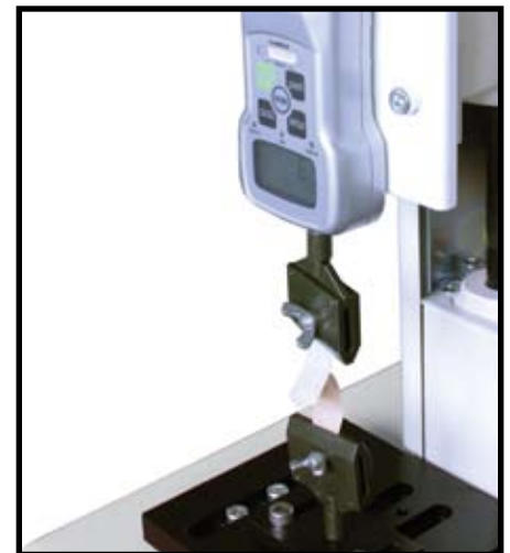
Stand with Optional Grip Performing Peel Test