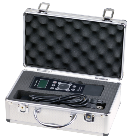
DT-326B in Included Protective Carry Case.

DISTRIBUTED BY: Electromatic Equipment Co., Inc. 600 Oakland Ave. Cedarhurst, NY 11516 www.Checkline.com 1-800-645-4330